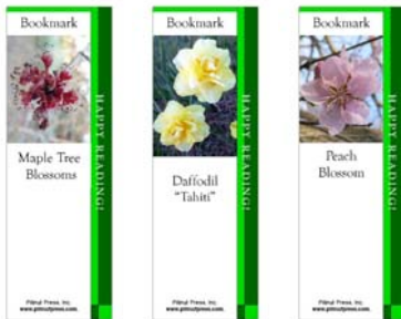
from the Storybook Blossoms Collection

Reference Desk Material: You will find lots of ideas for developing literacy skills on the Reference Desk feature on the www.pilinetpress.com website. Free teaching aids for parents and teachers are also available. Here are our latest articles.